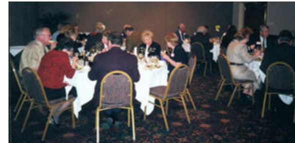
More than 25 CRS members attended the great dinner Tuesday night.