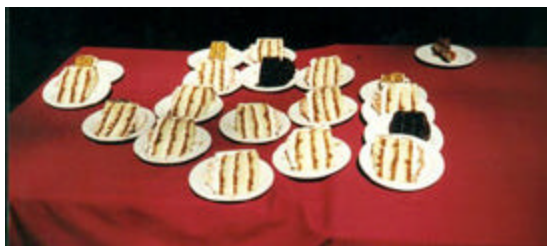
You have to admit that the dessert looks great. My favorite, by the way, was the chocolate cake!