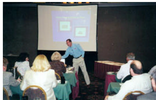
More than 50 Iowa CRS members attended the Sell-A-Bration technology session – Marketing to Today's Consumer. Most agreed that this class was a great learning tool for them.